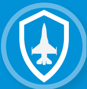
AVIATION DEFENSE SPACE